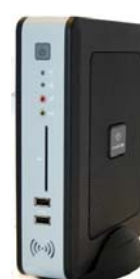
I8520 Atom Thin Client