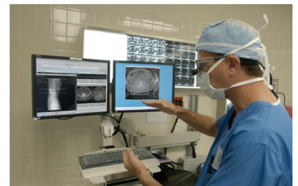
PACs in OR

The ClearCube solution is compatible with both the Stentor PACS system and Meditech Software (HCIS), critical components of Backus Hospital's technology infrastructure. Before the hospital installed Stentor on the ClearCube system in the operating room, physicians had to view plain film — a cumbersome and expensive process. The physician had to request the film to be brought to the operating room, then find and hang the appropriate film. With the PACS system installed on the ClearCube system, physicians now have immediate access to their images on flat screen monitors without the annoyance of a cumbersome PC at their feet. The ClearCube solution at Backus Hospital has been extremely popular with both the physicians and the nursing staff.