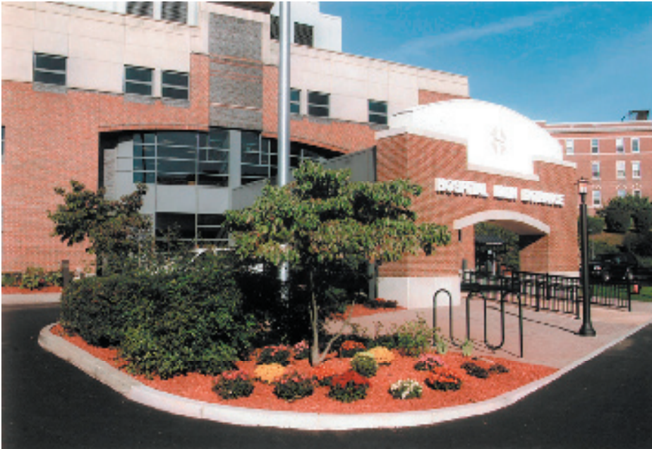
The William Backus Hospital

in high traffic areas, non-intrusive at the patient bedside, considerate of sterilization issues, and compatible with both the hospital's Picture Archiving Communication Systems (PACS) as well as its Health Care Information System (HCIS).