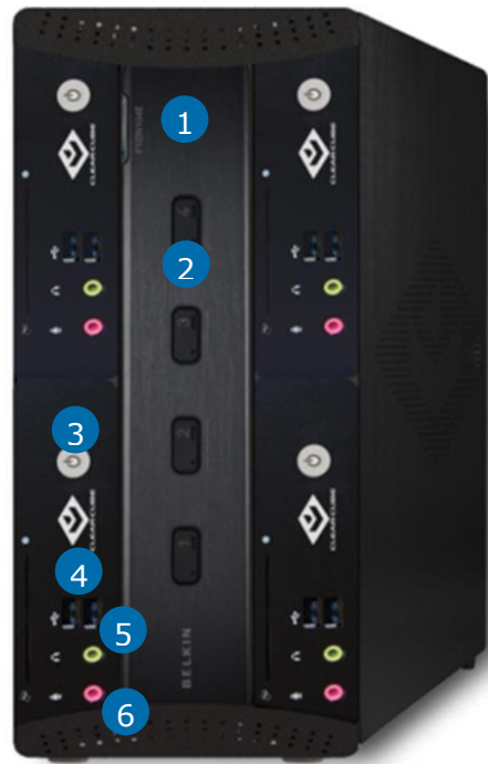
Figure 1. ClientCube NET-4, front view