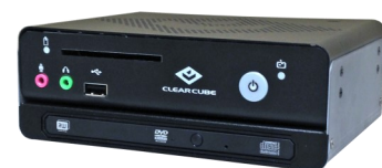
CD1024w/ attached DVD player and mounting carriage