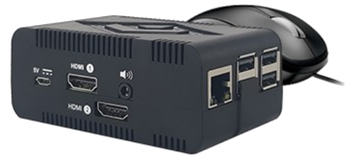
C3xPi is about the size of your computer mouse

ClearCube Cloud Desktop OS is a secure, minimal-footprint operating system option for ClearCube Thin Clients. Deployment options include installing Cloud Desktop OS locally, or network booting for Zero-Client-like security. Cloud Desktop OS comes with support for Citrix HDX, and a wide range of terminal services and virtual desktops. This efficient Linux ® -based operating system enables Administrators to centrally-manage secure and virus-proof Thin Clients that can connect to hosted desktops, cloud-hosted desktops, or centrally-hosted applications out of the box.